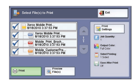
Personalized solutions you access right from the touch screen interface.

Secure. Mobile workers can print directly from their mobile devices and retrieve documents at a Xerox-enabled MFP with a secure confirmation code. Mobile professionals will no longer have to rely on others to print sensitive documents or risk leaving prints in the output tray.