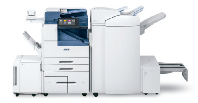
Xerox® AltaLink® B8045/B8055/B8065/B8075/B8090 Multifunction Printer