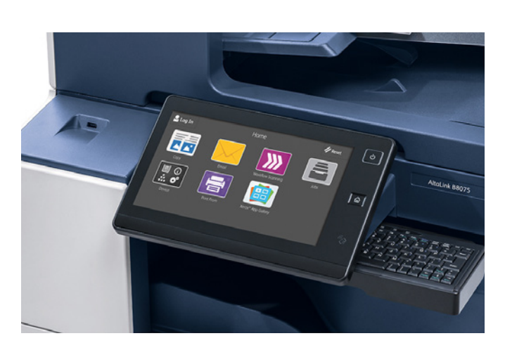
View a demo of our AltaLink device touchscreen at www.xerox.com/AltaLinkUIDemo .

This unmatched hardware technology and software helps everyone who interacts with our AltaLink multifunction printers get more work done, faster. Try our new UI at www.xerox.com/AltaLinkUI .