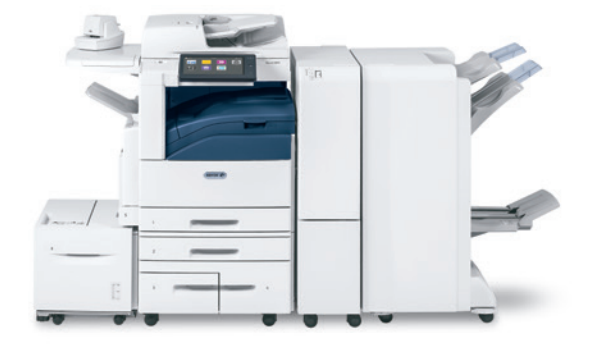
Xerox® AltaLink® C8030/C8035/C8045/C8055/C8070 Color Multifunction Printer