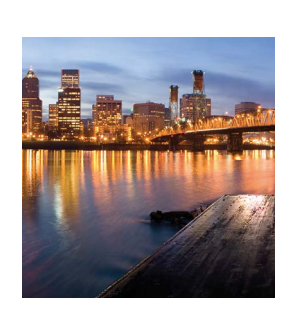
Flood an entire page for sheen and protection with a varnish effect.

Xerox has created a new benchmark by engineering beyond PANTONE simulations. These truly metallic Silver and Gold inks hit PANTONE 877 C and PANTONE 871 C, and offer some of the highest flop indexes – a measure of change in reflectance of a metallic colour – in the industry. Like Clear Dry Ink, Metallic Dry Inks can be applied at the design stage or can be added using the Fiery Image Enhance Visual Editor.