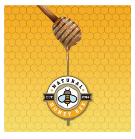
Enhance the look of photos and collateral with metallic image overlays.